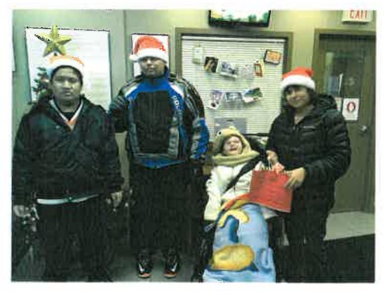
On the 18th of December a group of students went down to Siloam and made the donation on behalf of the Sisler School Community.

One life can be changed for ... $ change$ ! Many thanks goes out to all those who contributed to this great cause!